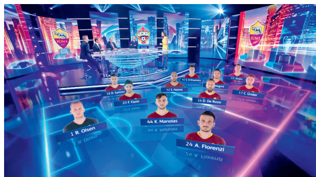
Sky Italia Studio case study with AR