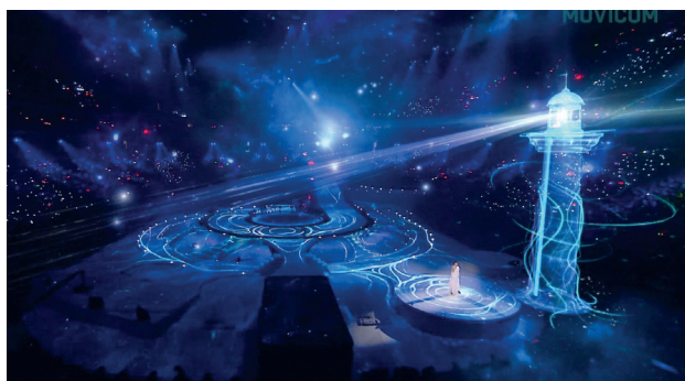
Tiktok show 2018