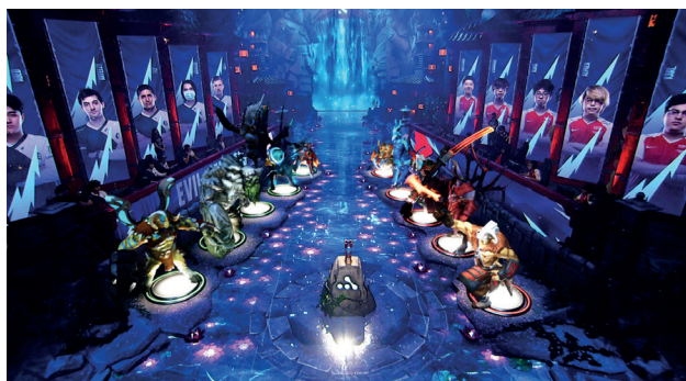
WePlay AniMajor Dota 2 Major 2021